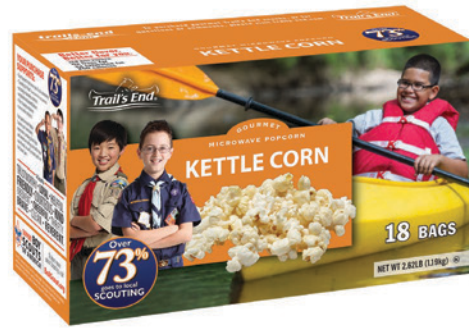
Microwave Kettle Corn