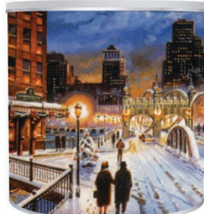
Chocolate Lover's Tin