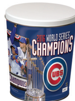
Cubs World Series Tin